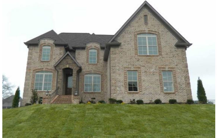
Illustrations of floorplan designs are artist renderings and are not intended to illustrate the finished product. Details will depend upon actual blueprint designs, builder specifications, and may vary depending on options selected.