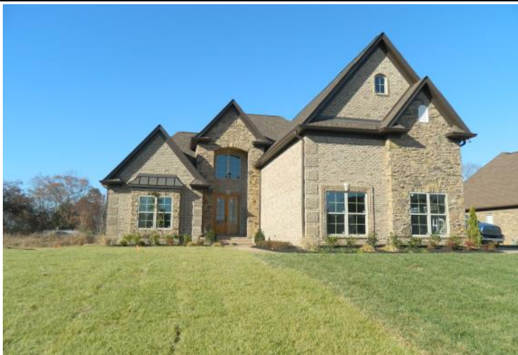
Illustrations of floorplan designs are artist renderings and are not intended to illustrate the finished product. Details will depend upon actual blueprint designs, builder specifications, and may vary depending on options selected.