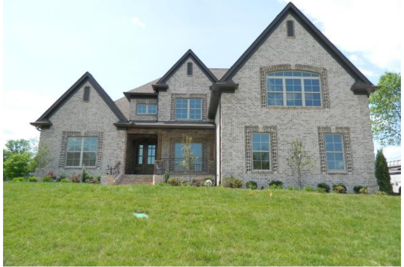
Illustrations of floorplan designs are artist renderings and are not intended to illustrate the finished product. Details will depend upon actual blueprint designs, builder specifications, and may vary depending on options selected.