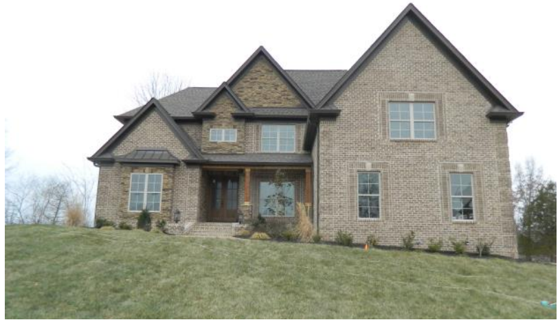
Illustrations of floorplan designs are artist renderings and are not intended to illustrate the finished product. Details will depend upon actual blueprint designs, builder specifications, and may vary depending on options selected.