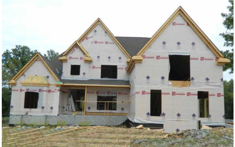
Illustrations of floorplan designs are artist renderings and are not intended to illustrate the finished product. Details will depend upon actual blueprint designs, builder specifications, and may vary depending on options selected.