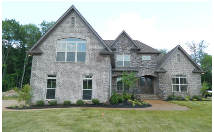
Illustrations of floorplan designs are artist renderings and are not intended to illustrate the finished product. Details will depend upon actual blueprint designs, builder specifications, and may vary depending on options selected.