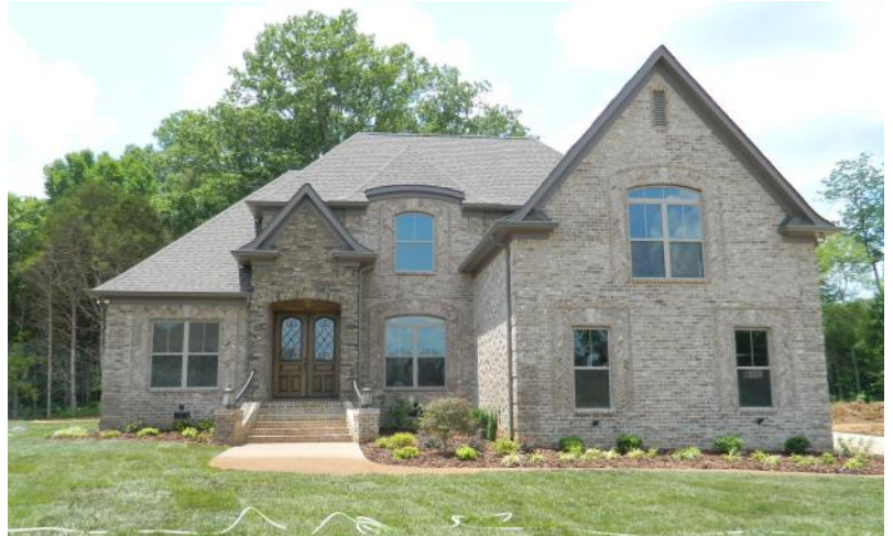
Illustrations of floorplan designs are artist renderings and are not intended to illustrate the finished product. Details will depend upon actual blueprint designs, builder specifications, and may vary depending on options selected.