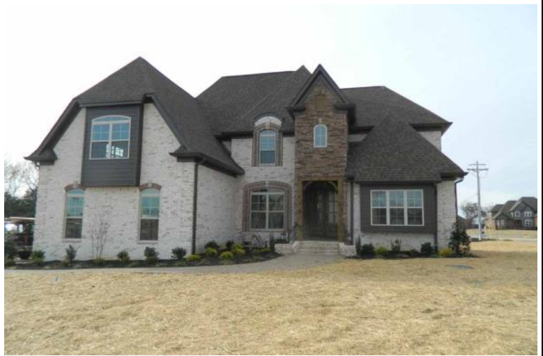
Illustrations of floorplan designs are artist renderings and are not intended to illustrate the finished product. Details will depend upon actual blueprint designs, builder specifications, and may vary depending on options selected.