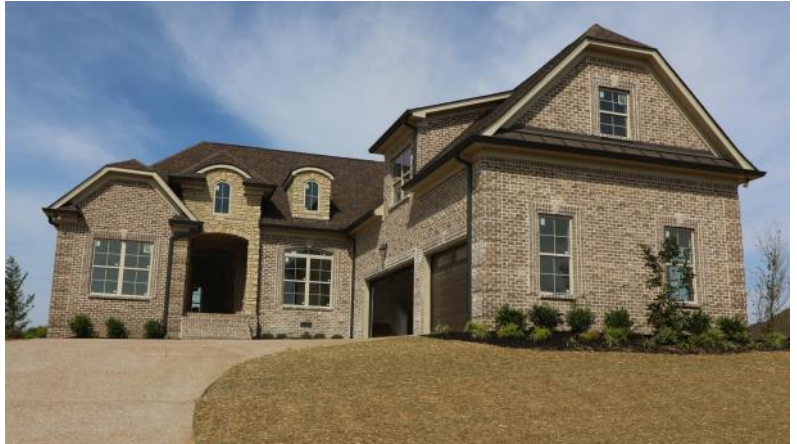
Illustrations of floorplan designs are artist renderings and are not intended to illustrate the finished product. Details will depend upon actual blueprint designs, builder specifications, and may vary depending on options selected.