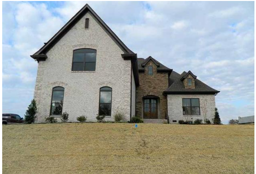
Illustrations of floorplan designs are artist renderings and are not intended to illustrate the finished product. Details will depend upon actual blueprint designs, builder specifications, and may vary depending on options selected.