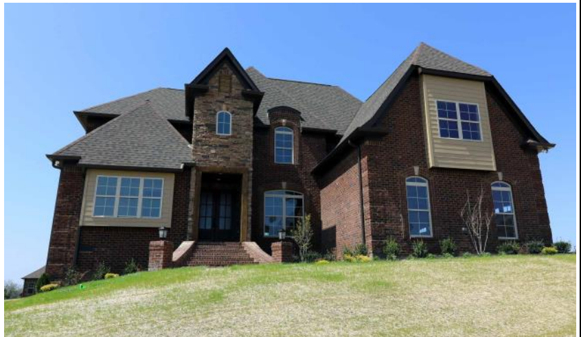
Illustrations of floorplan designs are artist renderings and are not intended to illustrate the finished product. Details will depend upon actual blueprint designs, builder specifications, and may vary depending on options selected.