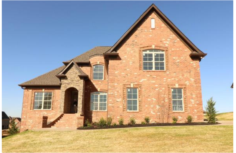
Illustrations of floorplan designs are artist renderings and are not intended to illustrate the finished product. Details will depend upon actual blueprint designs, builder specifications, and may vary depending on options selected.