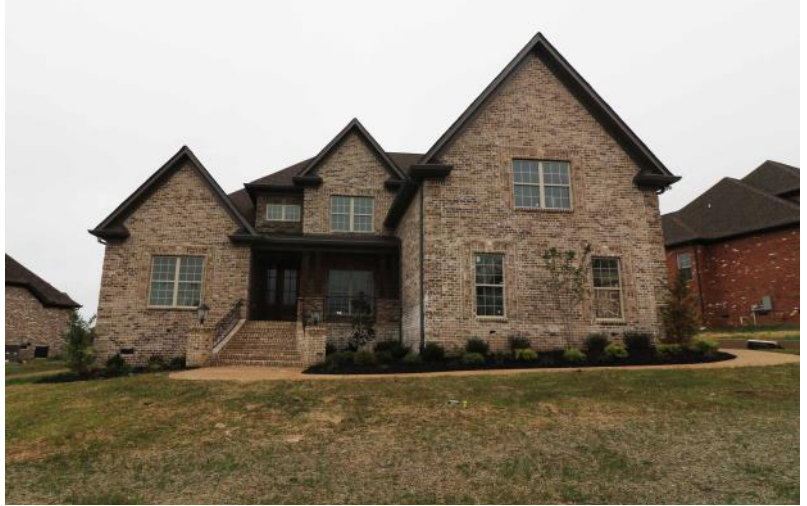
Illustrations of floorplan designs are artist renderings and are not intended to illustrate the finished product. Details will depend upon actual blueprint designs, builder specifications, and may vary depending on options selected.