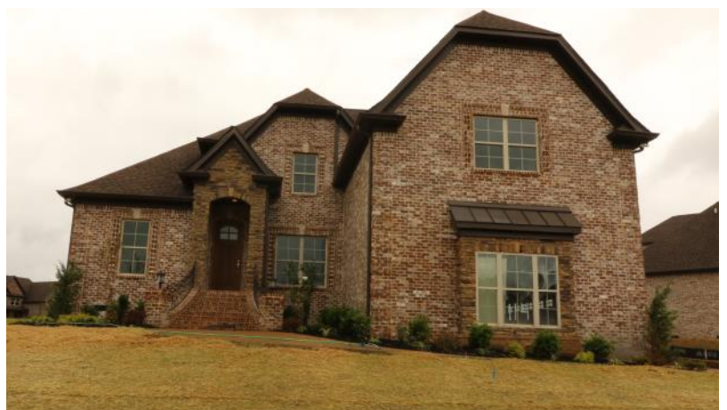
Illustrations of floorplan designs are artist renderings and are not intended to illustrate the finished product. Details will depend upon actual blueprint designs, builder specifications, and may vary depending on options selected.