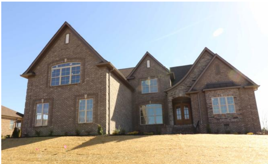
Illustrations of floorplan designs are artist renderings and are not intended to illustrate the finished product. Details will depend upon actual blueprint designs, builder specifications, and may vary depending on options selected.