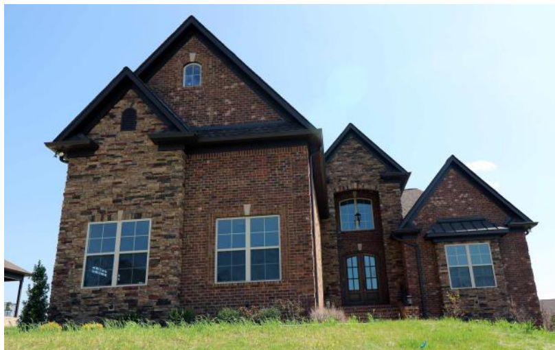
Illustrations of floorplan designs are artist renderings and are not intended to illustrate the finished product. Details will depend upon actual blueprint designs, builder specifications, and may vary depending on options selected.