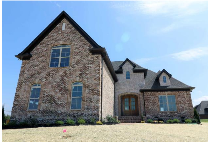
Illustrations of floorplan designs are artist renderings and are not intended to illustrate the finished product. Details will depend upon actual blueprint designs, builder specifications, and may vary depending on options selected.