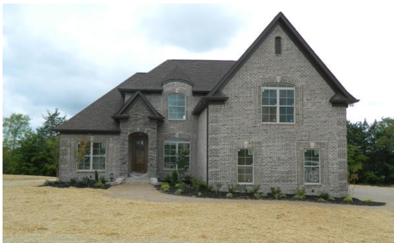
Illustrations of floorplan designs are artist renderings and are not intended to illustrate the finished product. Details will depend upon actual blueprint designs, builder specifications, and may vary depending on options selected.