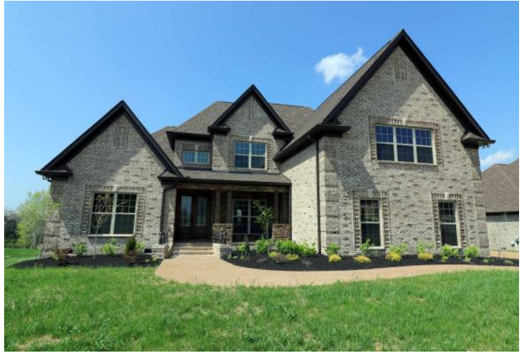
Illustrations of floorplan designs are artist renderings and are not intended to illustrate the finished product. Details will depend upon actual blueprint designs, builder specifications, and may vary depending on options selected.