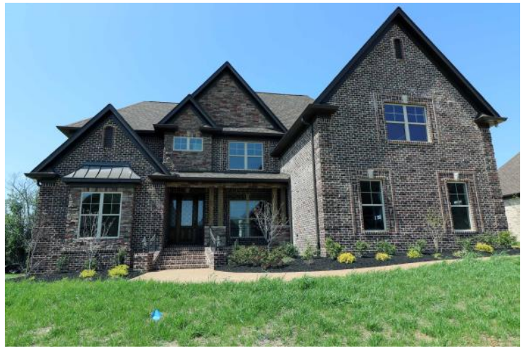
Illustrations of floorplan designs are artist renderings and are not intended to illustrate the finished product. Details will depend upon actual blueprint designs, builder specifications, and may vary depending on options selected.